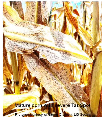
Mature corn with severe Tar Spot