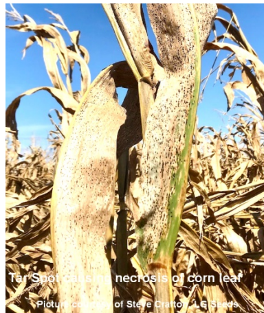
Tar Spot causing necrosis of corn leaf