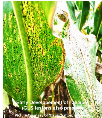
Early Development of Tar Spot (GLS lesions also present)

Tar spot was first diagnosed in a few counties in Northern Illinois and Northern Indiana in 2015. It is believed that wind-driven storms from Mexico distributed spores into those counties. The disease overwinters in soil debris and spores can be distributed further by storms. Tar spot is favored in cool conditions with high humidity. Tar spot symptoms on the corn leaves are round raised black spots that feel "bumpy" when you touch them. Tar spot alone is mainly a "cosmetic" disease with little known yield loss. In Latin America, combinations of Phyllachora maydis along with Monographella maydis and or Coniothyrium phyllahorae organisms have led to significant yield losses. But these combinations have not been found in the Midwest. Some feel that it's a combination of Phyllachora maydis and another "unknown" organism that is causing the same symptoms in the Midwest as in Latin America. "Fish-eye" is a visual characteristic of the combination of the two organisms which can lead to severe leaf necrosis, stalk quality and a greater potential of yield loss.